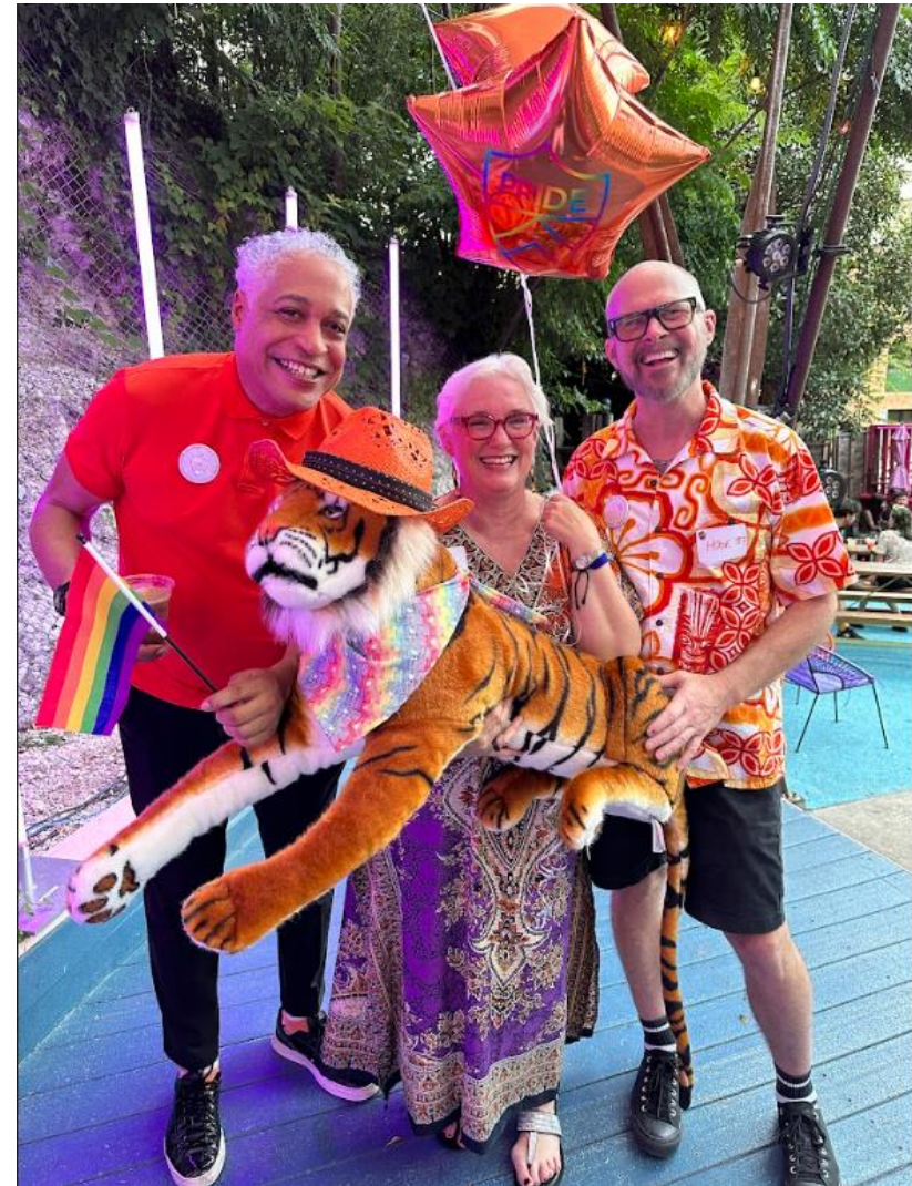
Princeton Club of Austin CPP event, June 2023

Regional Affairs Team at acra@princeton.edu