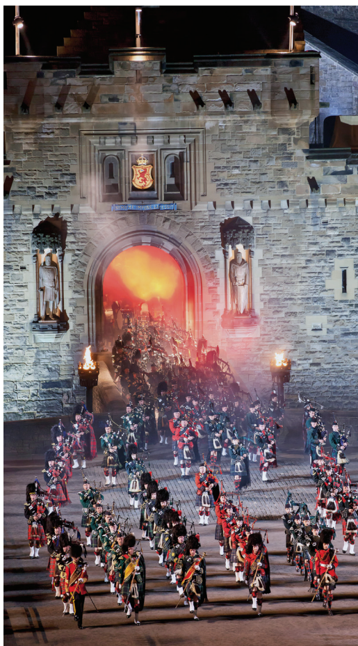
Scene from the Royal Military Tattoo