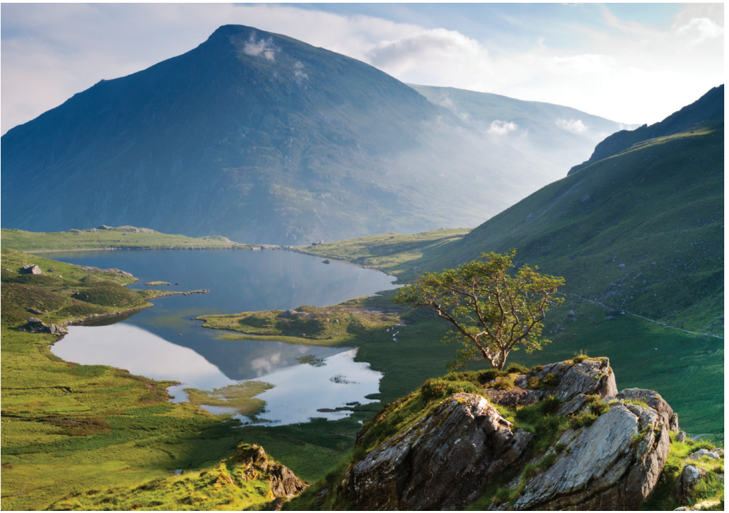
Wales' pristine Snowdonia National Park, which we visit on Day 8

Day 7: Lake District/North Wales We travel through splendid Lake District scenery today en route to Wales, with its rugged natural beauty and distinct culture. Our first stop is at Bodnant Garden, the historic 80-acre National Trust property with a lovely hillside setting and ever-changing displays, from manicured lawns to flower-filled terraces. After our visit, we continue on to the seaside town of Llandudno, dubbed “Queen of the Welsh Resorts,” and our home for the next two nights. We dine tonight at our hotel. B,D