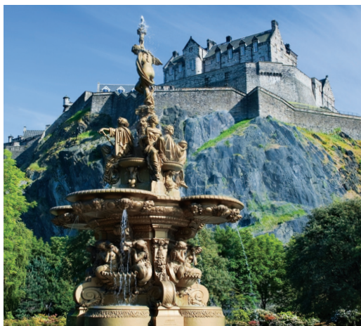
Scotland’s Edinburgh Castle

Day 14: Depart for U.S. We transfer this morning to Heathrow Airport for our flights home. B